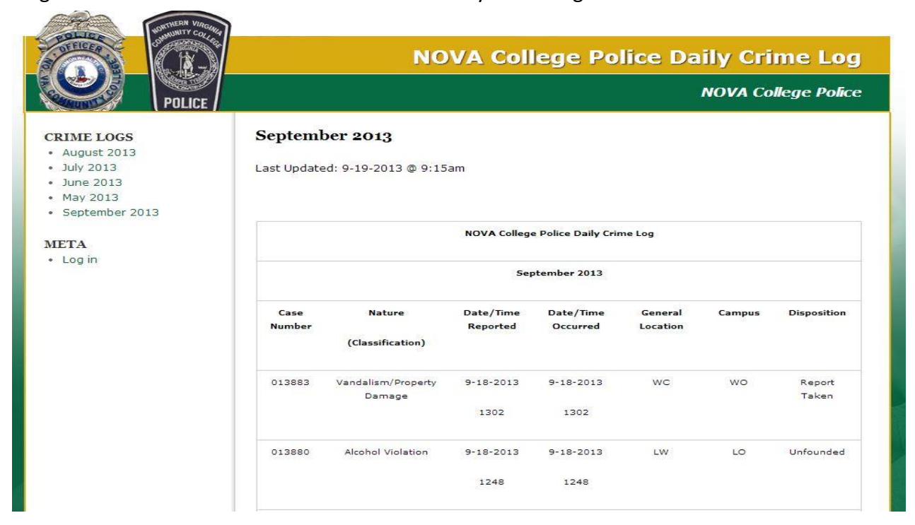
Figure 3.2 Figure 3.2 is a screenshot of the NOVA Police Daily Crime Log