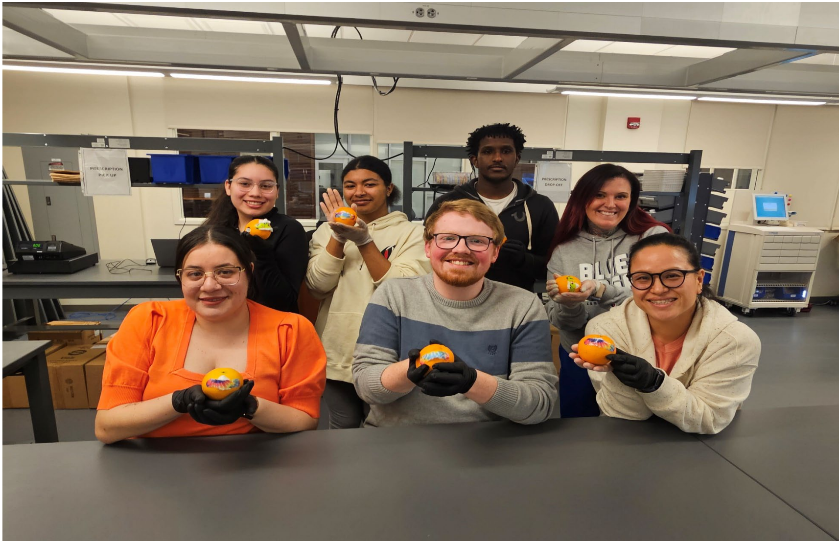
ORANGE PATIENTS: At Blue Ridge Community College's Pharmacy Technician simulation lab, the class reviewed the laws, regulations, and requirements for pharmacy technicians to be able to administer immunizations to patients. Students then used oranges to simulate giving a vaccine to a patient - using a syringe and needle and injecting colored water into the orange.