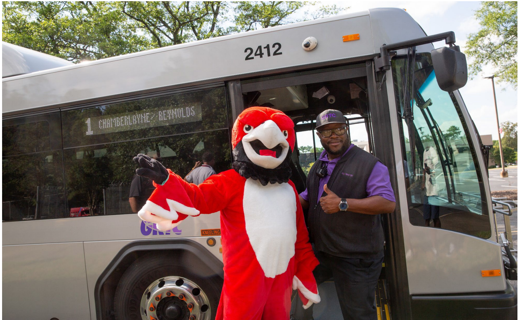
ACCESS ON WHEELS: GRTC Route 1 expanded access to J. Sargeant Reynolds' Parham Road Campus. Service operates every 30 minutes Mon-Saturday and hourly on evenings and weekends. On Feb. 4, Transit Equality Day honors Rosa Parks, a civil rights leader who refused to give up her seat on a segregated bus in 1955.