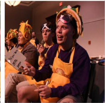
FOOD FUN: The Hungry Games were featured at the annual Student Leadership Conference, which was attended by more than 200 students from 21 of Virginia's Community Colleges. Students tossed seasonings, tasted their creations, and touted their treats before judges. Students also gained valuable insights into leadership by participating in professional workshops with discussions led by Hoan Do and Stan Pearson and connecting with community leaders.