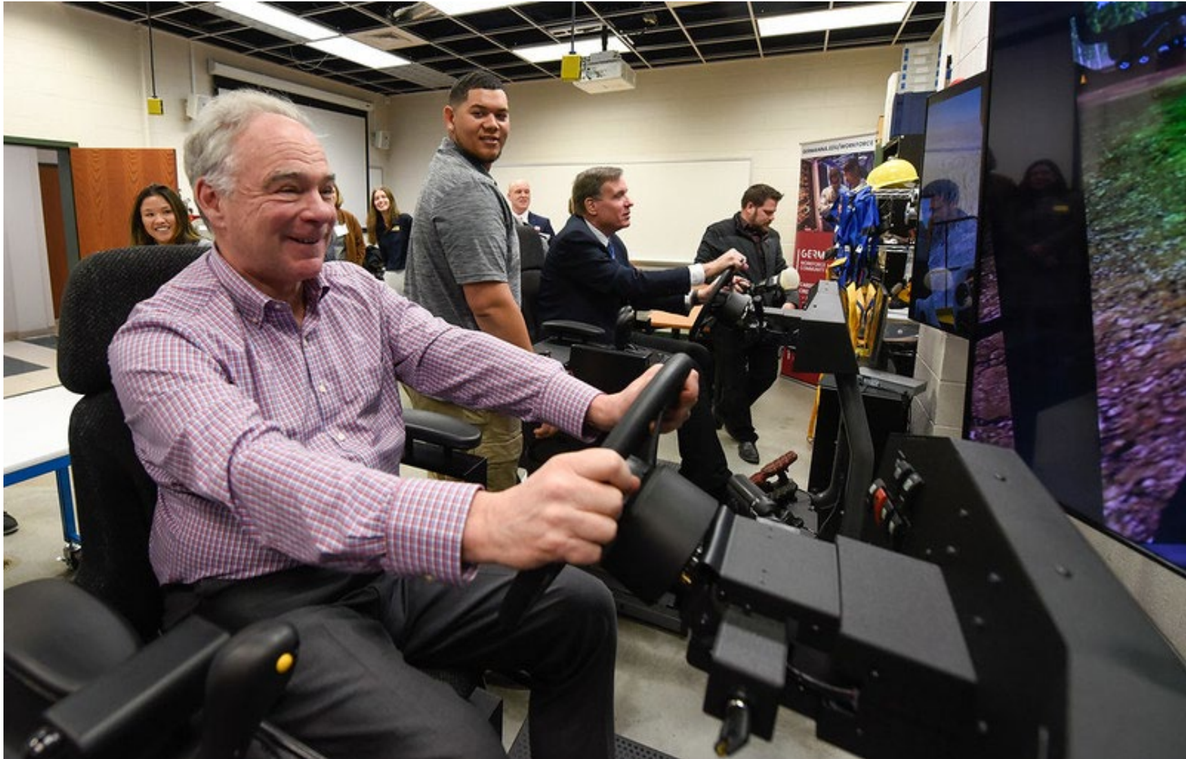
DRIVING SUCCESS: U.S. Senators Tim Kaine (left) and Mark Warner test drive simulators used in Germanna Community College's heavy equipment operator certification program. While there, the senators participated in a roundtable and announced federal funding to support early childhood education and internships for foster youth participating in Great Expectations.