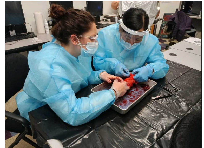
Echo students studying anatomy of a pig heart in the DMS lab