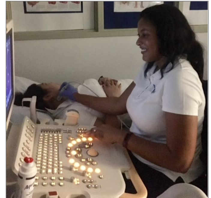
DMS student scanning a fellow student in the Sonography lab