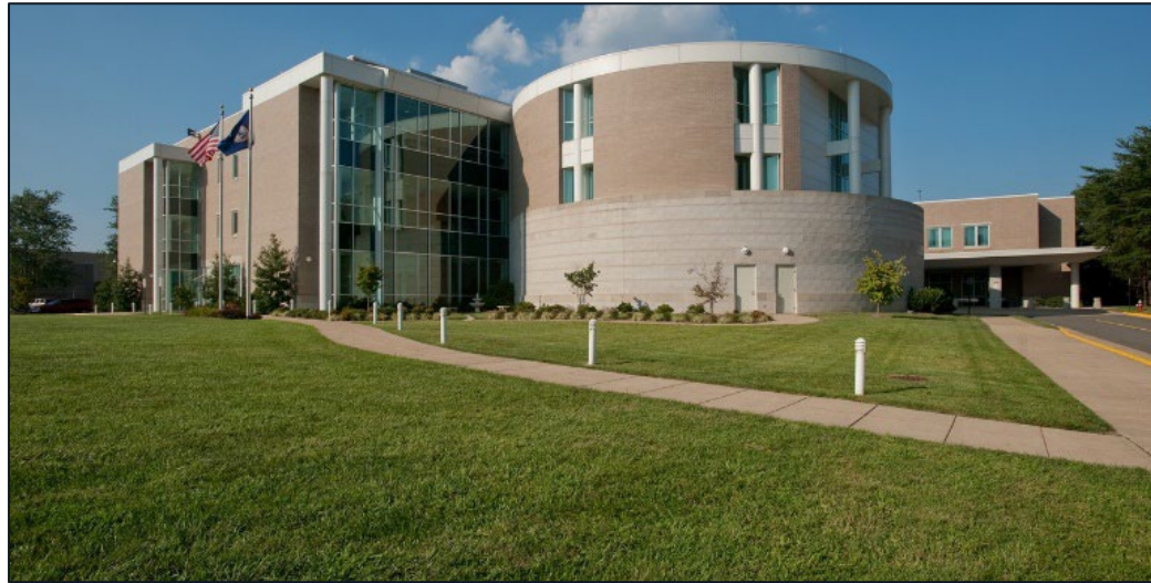
Medical Education Campus in Springfield, Virginia

Email, chat, live Zoom sessions, or in-person nvcc.edu/advising