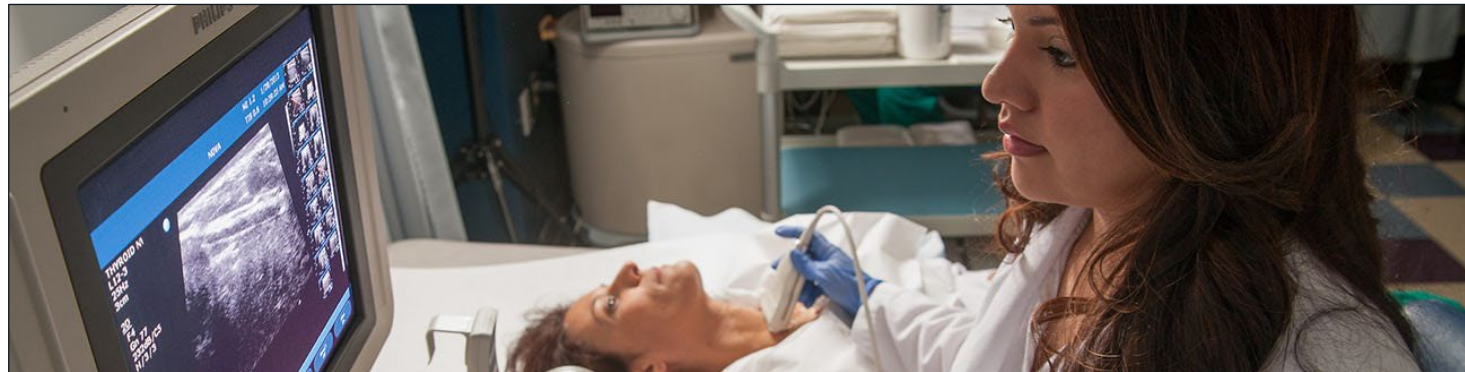
DMS student scanning a fellow student in the Sonography lab