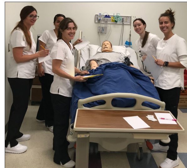
DMS students working with a phantom in the simulation center