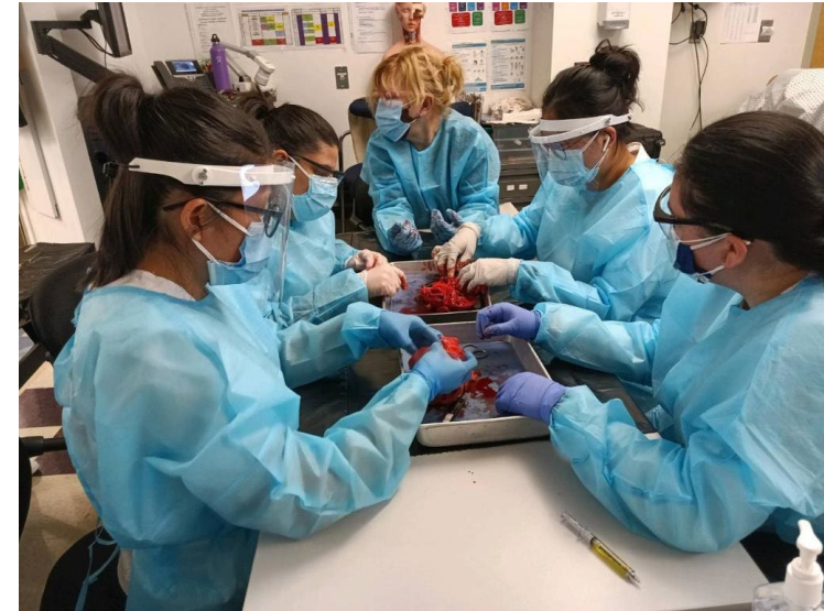
Echo students studying anatomy of pig hearts in the DMS lab