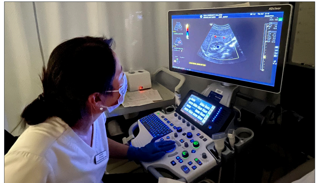
Student labeling an ultrasound image

NOVA | Northern Virginia Community College