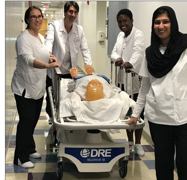
DMS students working with a phantom in the simulation center